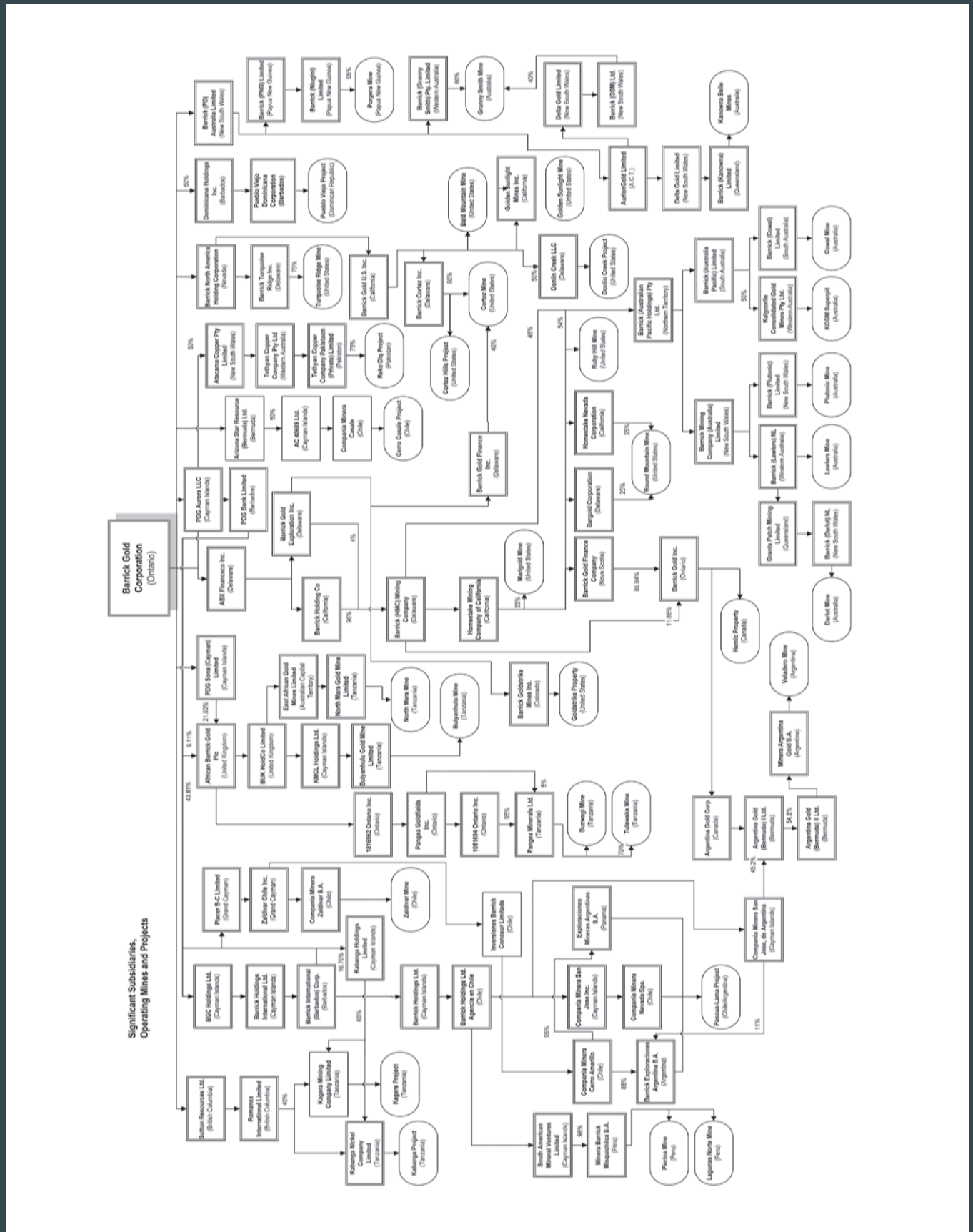
Table 6: Barrick Gold Corporations' pipe-like maze of subsidiaries