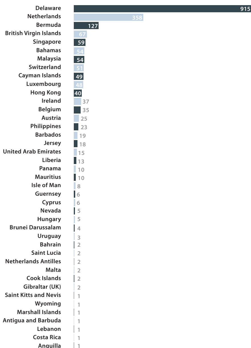
Table 4: The Extractive Industries Subsidiaries Favourite Secrecy Jurisdictions

In second place, by a similar wide margin, is the Netherlands. The Netherlands is not normally bracketed with palm-fringed island paradises or snow-coated Alpine micro-states when corporate financial secrecy is discussed.